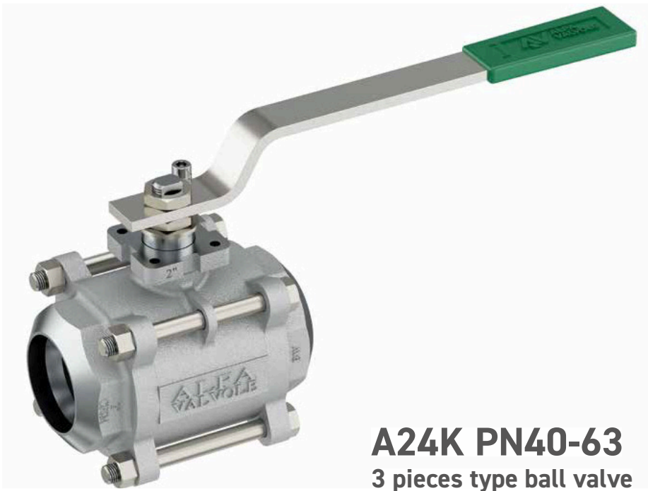
A24K PN40-63 3 pieces type ball valve